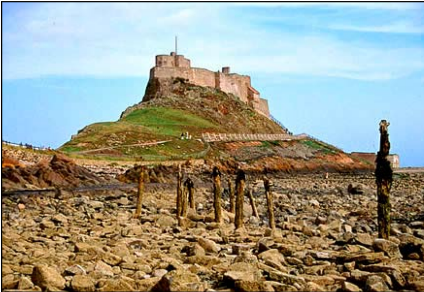
“Holy Island” at low tide. See page 2.